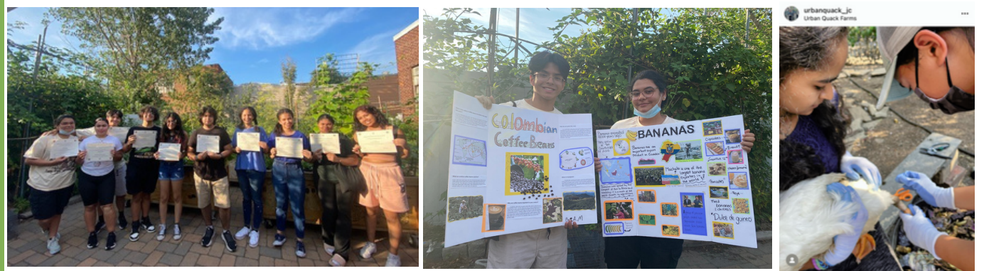
Photo (left): Youth at Guttenberg Arts with certificates; (center) Youth presenting their final projects; (right) Youth at Urban Quack.

We had another successful year of Youth Urban Farm Club, in which over 65 youth ages 10-18 learned about gardening, composting, animal husbandry, urban agriculture, herbalism, and art. Our youth supported with beautifying their community, maintaining gardens and compost operations, creating art projects centered on plants, crops, and agriculture, learning to take care of farm animals in an urban setting, and meeting new friends! They also gained volunteer community service hours for their participation. Our exceptional adult volunteers from eight different sites provided a fun and supportive settings for our youth to enjoy a great summer outdoors.