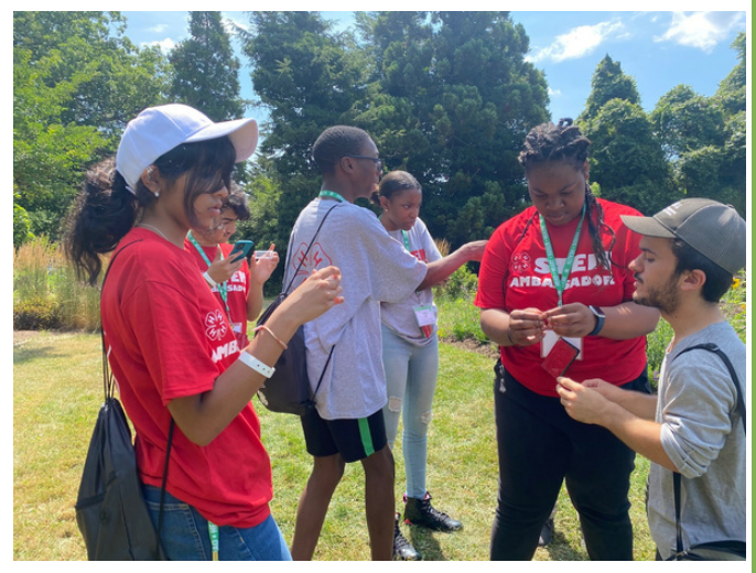
Photo of 4-H STEM Ambassadors at Rutgers Gardens learning about bees.

After almost two years of virtual programming, 4-H STEM Ambassadors relaunched in person once again at our Rutgers New Brunswick campus in July, where 12 Hudson County youth engaged in learning from Rutgers scientists and engineers, participated in research projects, gained leadership skills, and obtained college readiness skills. Youth spent close to a week on campus exploring STEM, team building, visiting the various campuses, and much more. Youth were trained in various STEM activities and challenges, which they will teach to younger youth as part of their yearlong participation in the 4-H STEM Ambassador program. Recruitment for this program opens up again next March 2023!