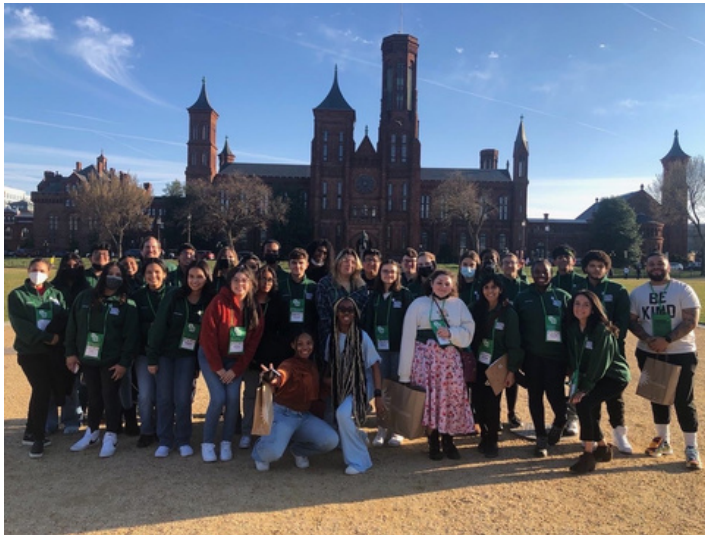
Photo from Summit: our 28 youth delegates with their chaperones in the National Mall

This winter, 28 NJ 4-H youth delegates traveled to the Washington DC metro area for the National 4-H Youth Agri-Science Summit to develop skills and knowledge to address issues in agriculture, food security, and sustainability. The Summit was an engaging learning and networking opportunity for the youth delegates from various regions of the state, including four youth from Hudson County. This experience highlighted the many ways that agriculture and food systems is relevant in their lives and how it impacts their communities. In addition to hearing keynote speakers, attending workshops, and meeting youth from across the country, the youth delegates created a community action plan focused on pollinator habitats to engage their peers and communities.